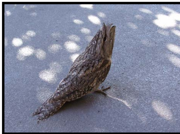
Fig. 1. We had an unexpected visitor to our school, outside the Sensory Room: a Tawny Frogmouth Owl.