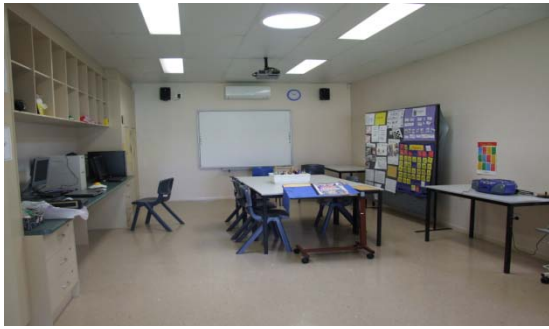
The new Life Skills Classroom.